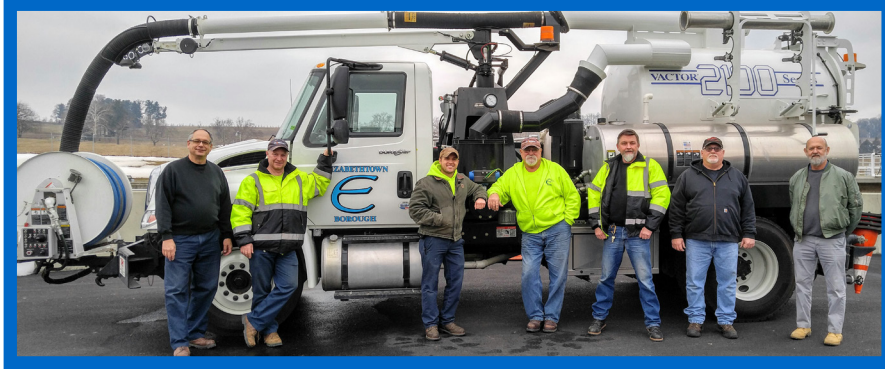
Wastewater Treatment Plant