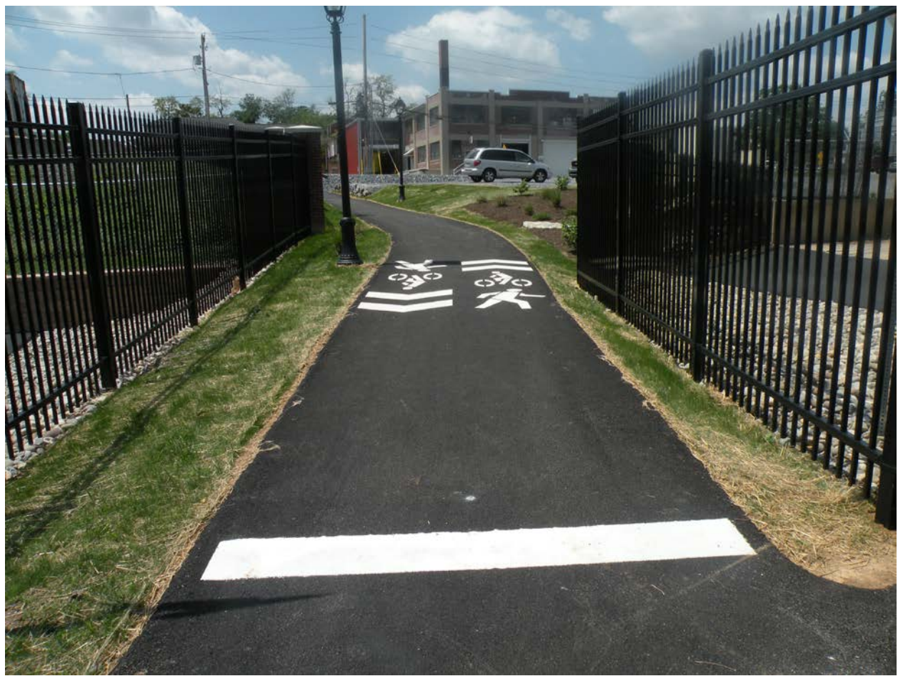
From Self-Storage of Elizabethtown looking west