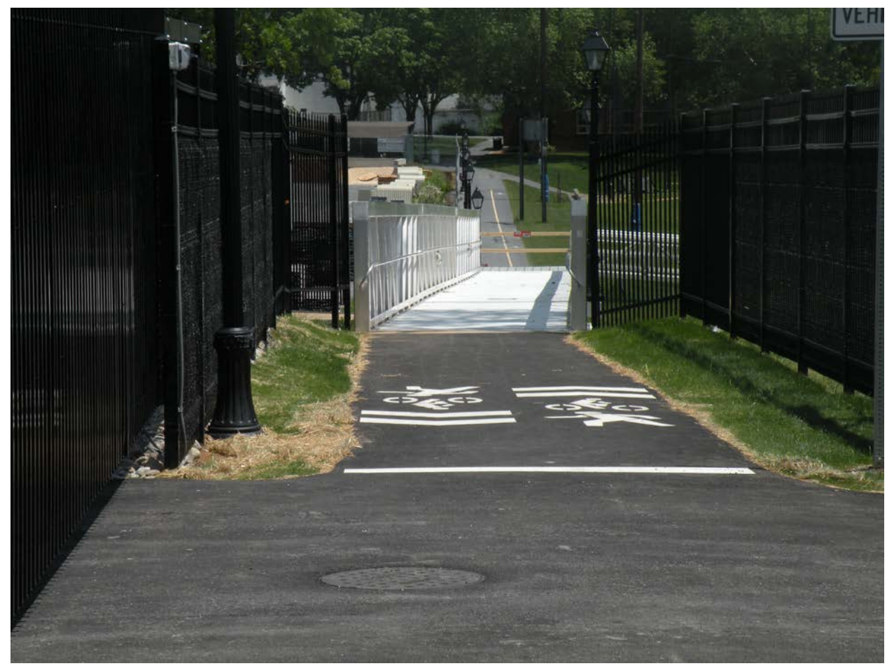
From Self-Storage of Elizabethtown looking east

We are on track to bid Phases III and IV of the pathway network concurrently in July with work expected to begin in late summer/early fall. These two phases take the pathway from Market Street east through Community Park and to the School District campus.