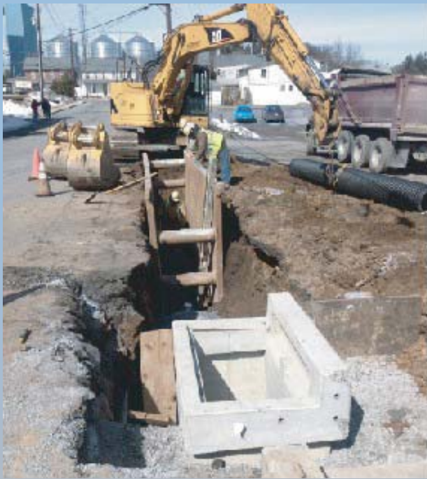
Horst Excavating shown working above.