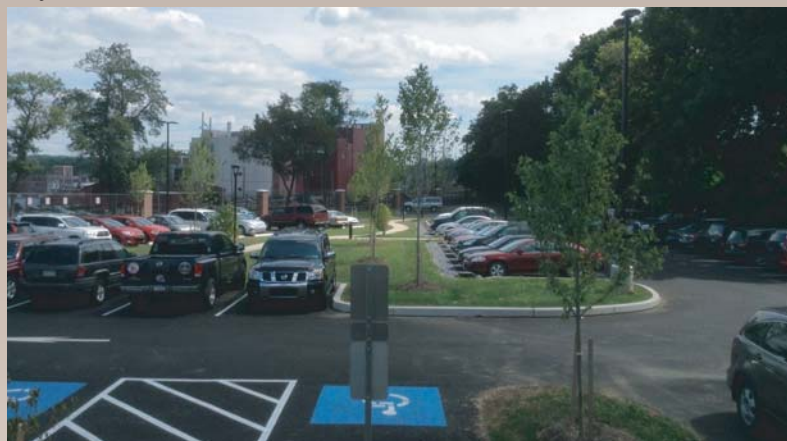
Train Station Overflow Lot looking South